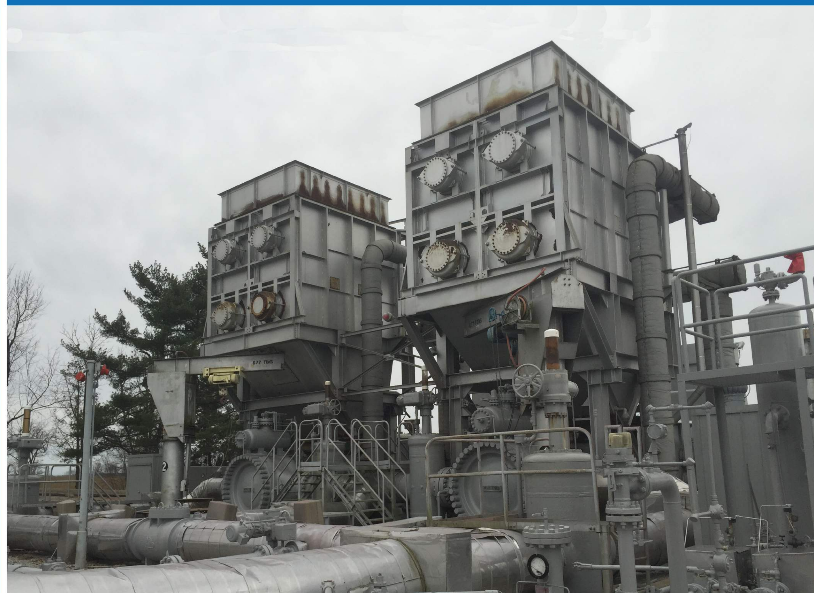
SPECTRA ENERGY GAS TURBINE DANVILLE COMPRESSOR STATION